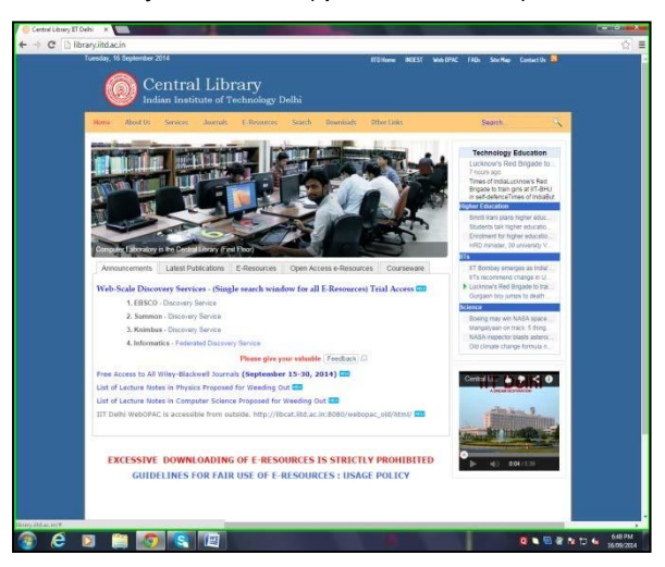
Fig.3: Central Liibrary, IIT, Delhi.JRD Tata Memorial Library, IIS, Bangalore

Some examples of the modern libraries in India are Library of Indian Institute of Technology, Delhi (an academic library), JRD Tata Memorial Library of Indian Institute of Science, Bangalore (a special Library), National Library, Kolkata and Connemara Public Library, Chennai (public libraries).