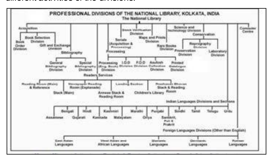
Fig.5: Divisions of National Library, Kolkata.

The number of sections/ divisions in a library may vary from basic 6 divisions to as many as 15 divisions. For example in big libraries like National library, Kolkata there are as many as 31 divisions and under these divisions there are 20 sub-divisions to carry out different activities of the divisions.