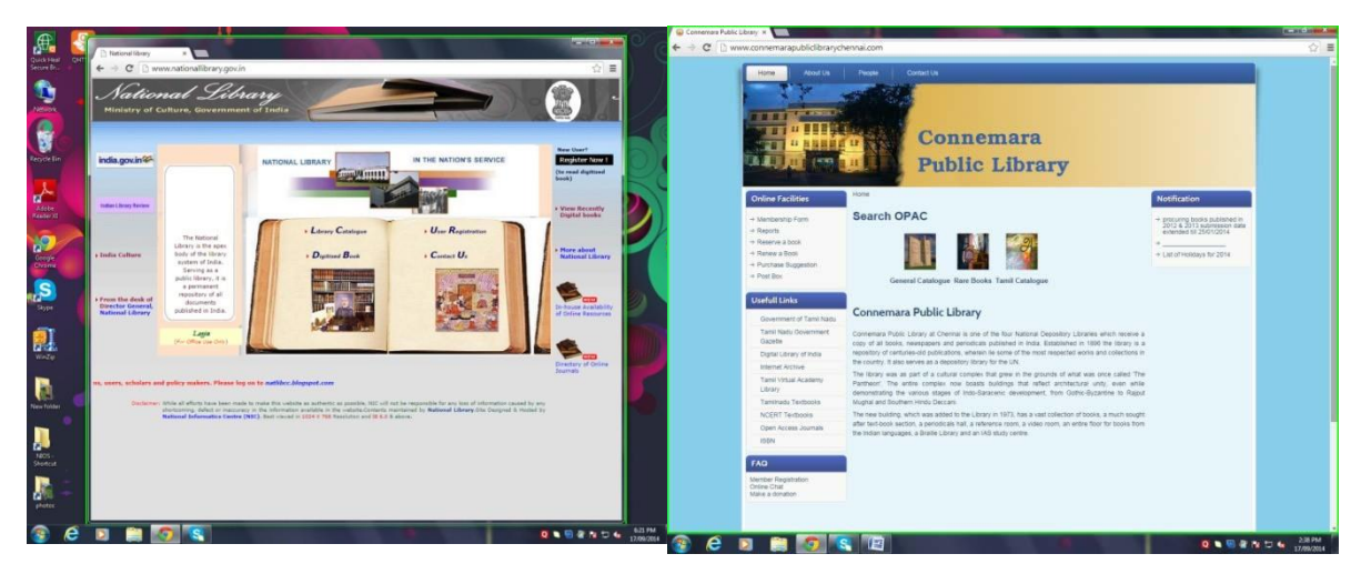
Fig.4: National Library, KolkataConnemera Public Library, Chennai