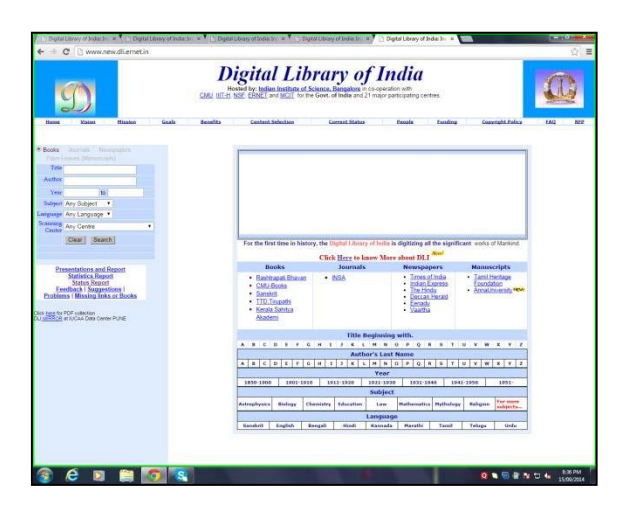
Fig.1: Snapshot of Digital Library of India (<a href="http://www.newdli.ernet.in/">http://www.newdli.ernet.in/</a>)

processed and organized digital repository of knowledge. Such repository is created to serve the user community as the traditional library serves the users. For example Digital Library of India (DLI) is a digital library of books, predominantly in Indian languages which are searchable and are available free to everyone over the Internet. In addition, DLI provides links to 6 Indian online newspapers and INSA (Indian National Science Academy) journals.